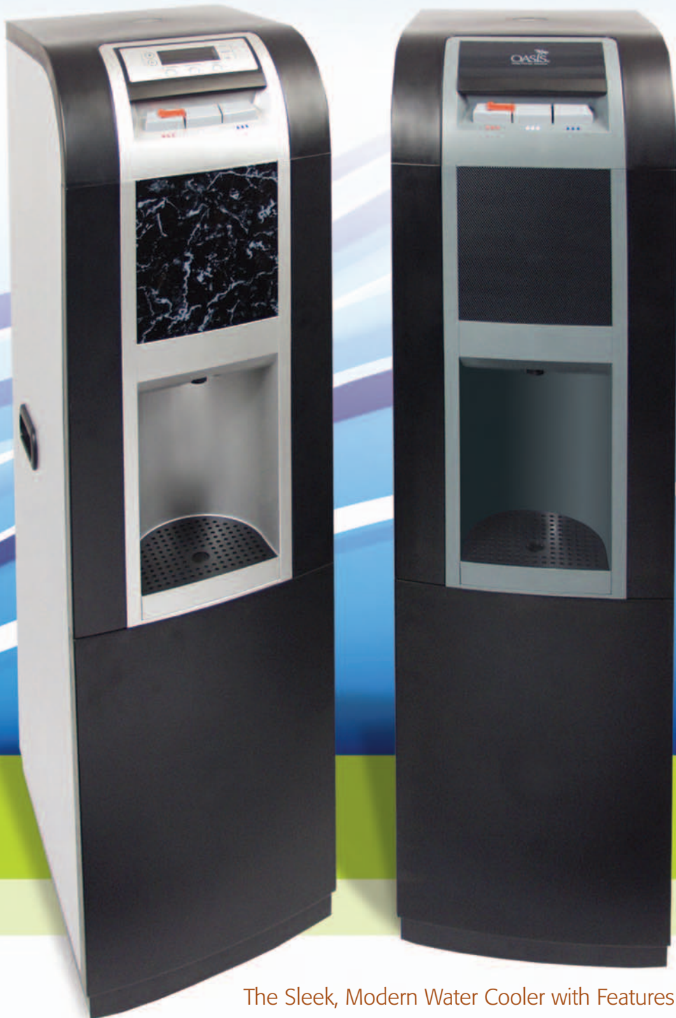
AQUA BAR II DELUXE/ULTRA WITH MARBLE STYLE PANEL