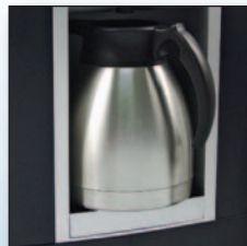
Large faucet alcove for filling sports bottles and carafes.