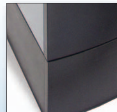
Accessory pedestal to increase faucet-to-floor height by 6-1/2".

SIDE HANDLES AND REAR ROLLERS ENABLE EASY TRANSPORT