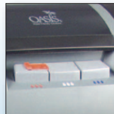
Aqua Bar II Standard Series control panel.