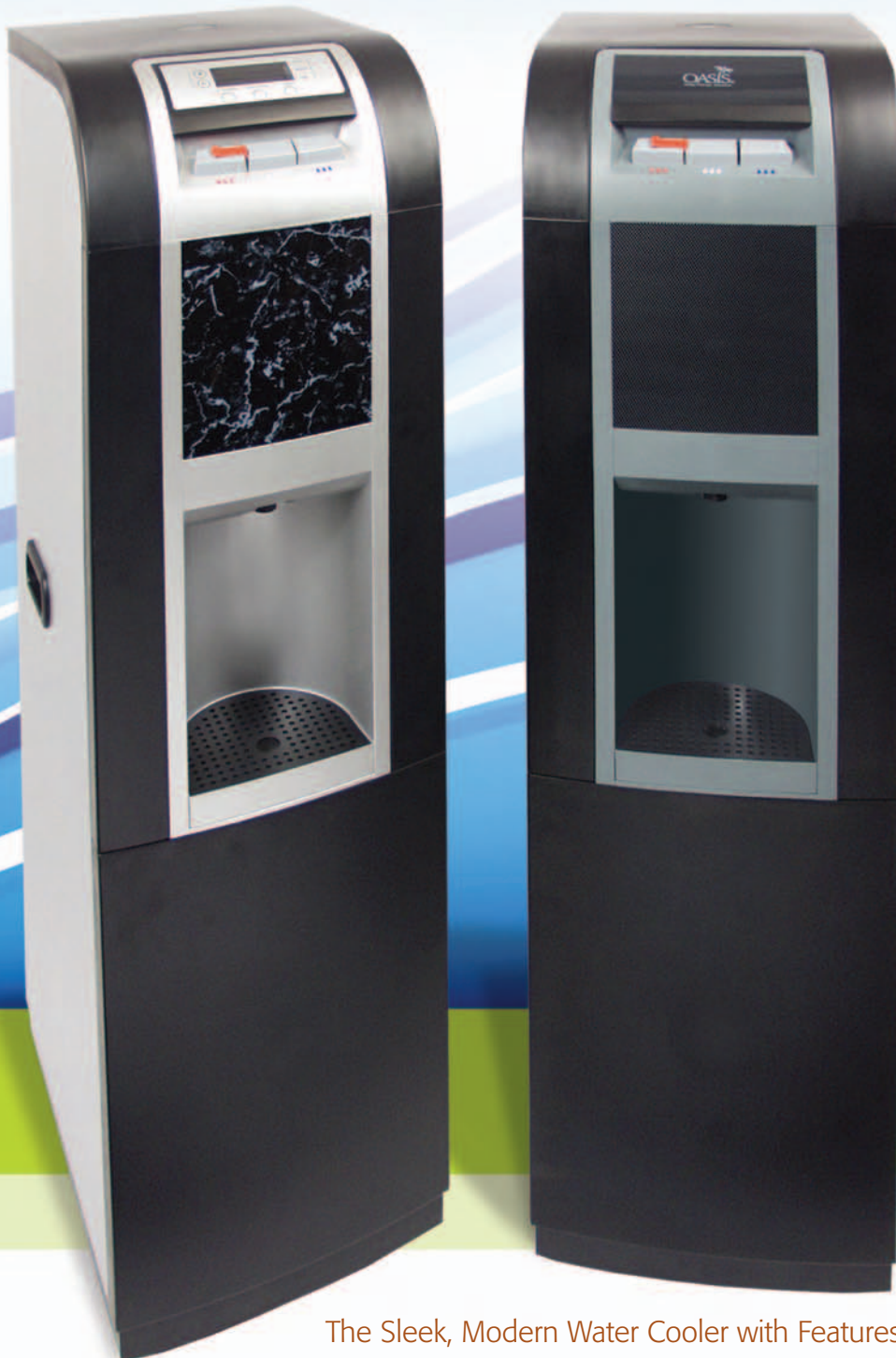
AQUA BAR II DELUXE/ULTRA WITH MARBLE STYLE PANEL